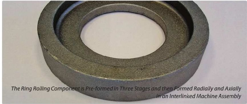
The Ring Rolling Component is Pre-formed in Three Stages and then Formed Radially and Axially in an Interlinked Machine Assembly