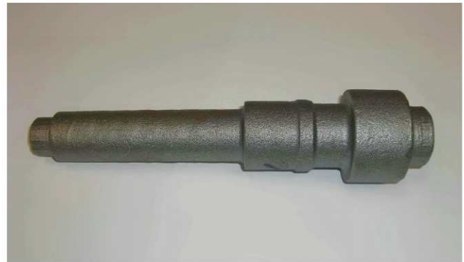
After Inductive Heating to 1240 Degrees, the Component Is Formed on a Cross Wedge Roll

hout process simulation are compared, a 1:10 ratio will be the result. For a definition of the optimal process through real testing, various staff members and expensive machine hours would be needed – possibly multiple times – until the perfect process could be defined. In addition, no production is possible on the machine during the testing time. A comparison with the initial and the running costs of a simulation workstation shows that in most cases, the investment in virtual tools have amortized after only one project.