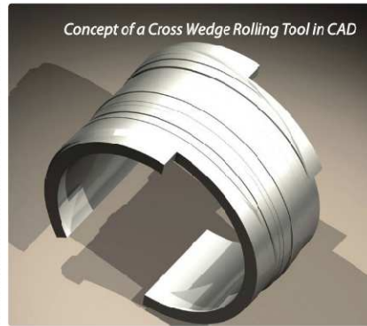
Concept of a Cross Wedge Rolling Tool in CAD