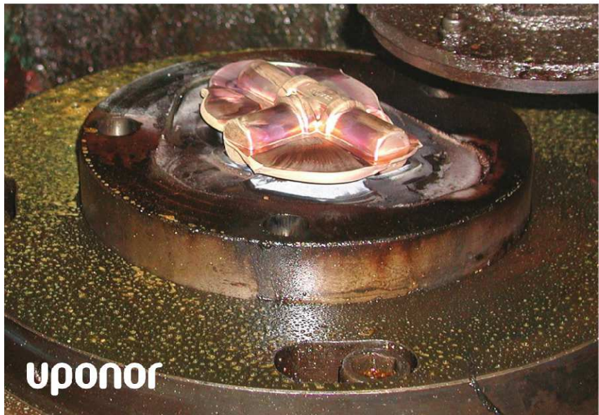
Single Manufacturing of a Brass T-Piece

In addition, Uponor is working on a new layout of the forming process with a new press. This new machine would permit hollow extrusion and thus the preforming of inner contours. The additional savings in material would be substantial. The forming energy would be received by the lower die in this case, diverted