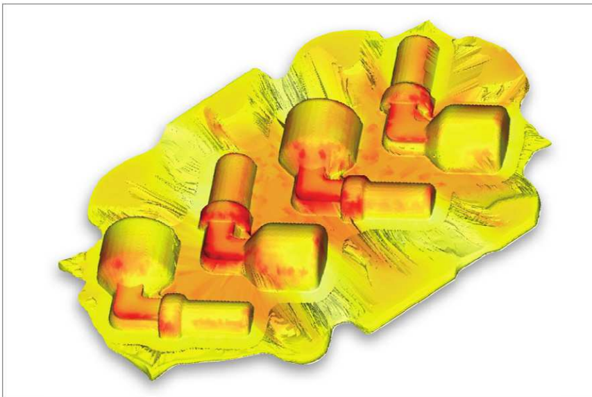
Temperature Profile for the Quadruple Forging of a Brass Elbow