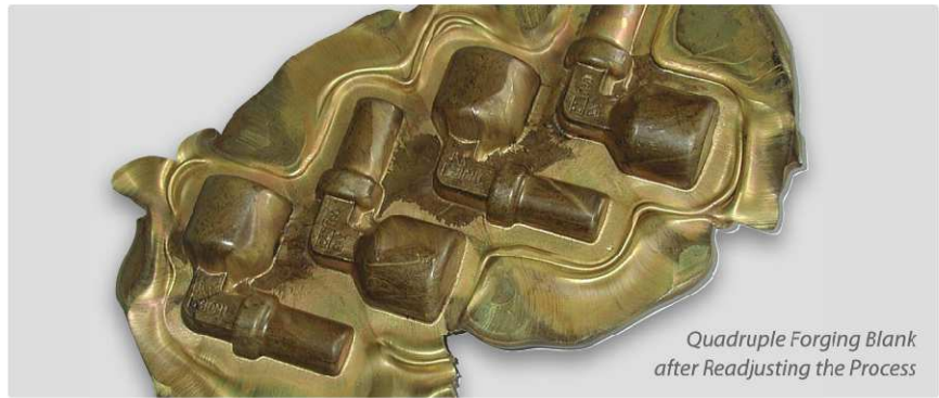
Quadruple Forging Blank after Readjusting the Process